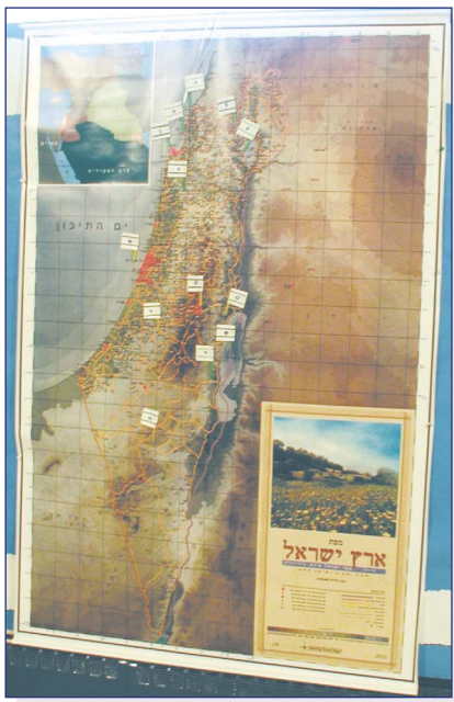
Map illustrating the trip to Israel.