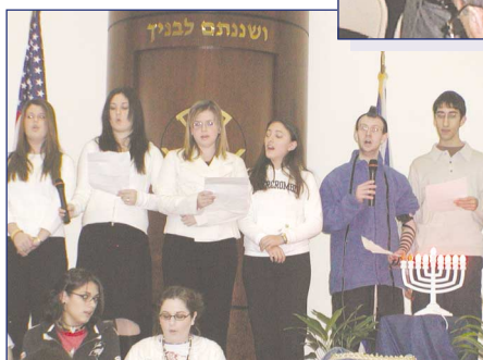
Bottom: Student Chorus during the Aron Kodesh Dedication.