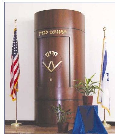
The new Aron Kodesh.