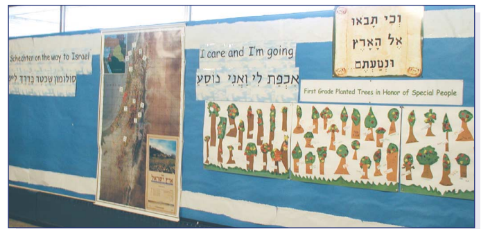
1st Grade students' project related to the Israel trip.